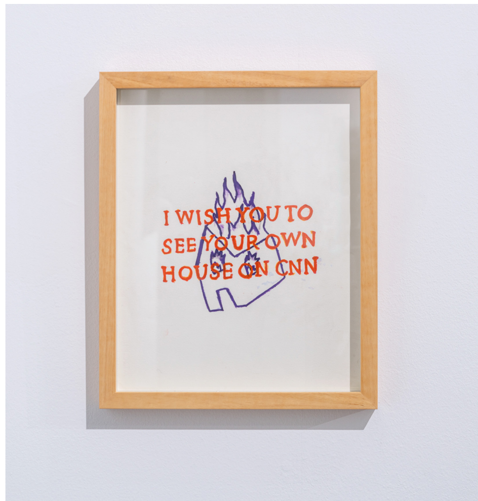
Can Not Navigate , 2019 45 × 35 cm, Acrylic drawing on paper Installation view: We're Not Like Them —MMSU, Rijeka