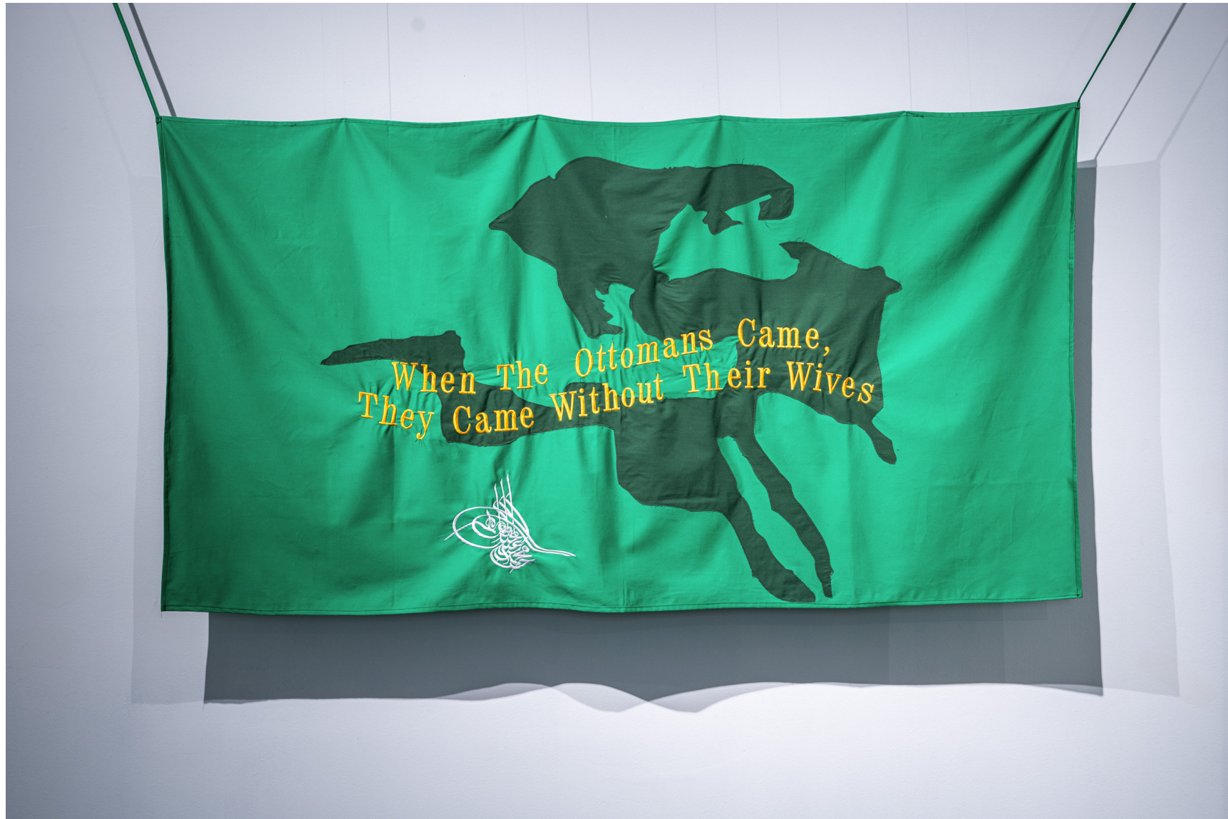
When they came , 2019 250 × 250 cm, collage textile flag Installation view: We're Not Like Them —MMSU, Rijeka