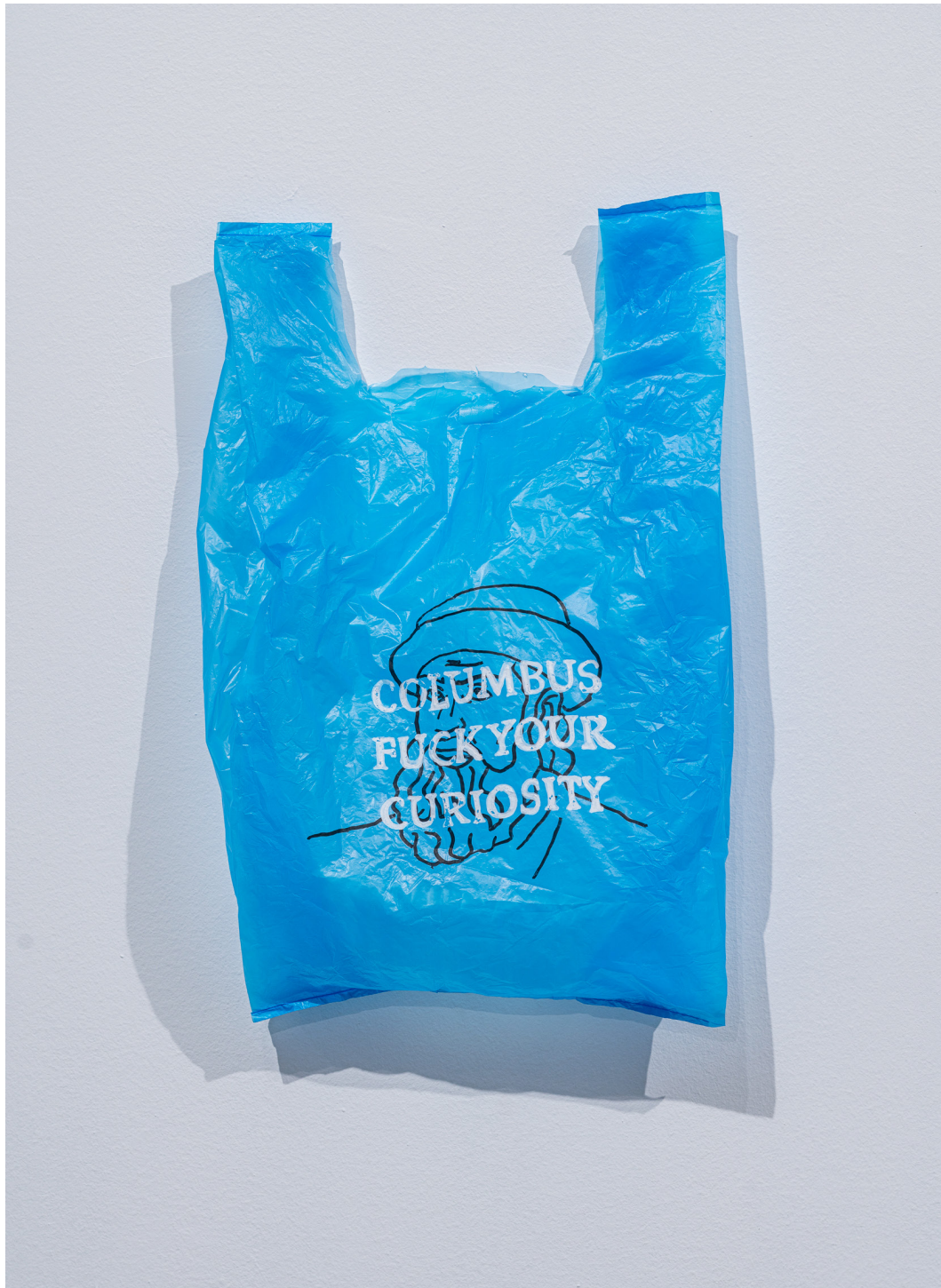
Christopher Columbus , 2019 40 × 35 cm Acrylic drawing on found plastic bag Installation view: We're Not Like Them —MMSU, Rijeka